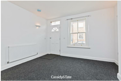
Ground Floor Approx. 455.6 sq. feet